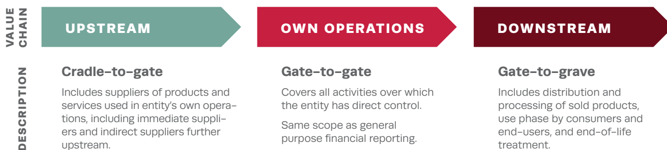
Figure 2: Value chain levels of an entity

63. A direct impact of an entity is an impact caused or contributed to by the entity's own operations. An indirect impact is an impact directly linked to the entity's own operations, products, or services through its business relationships in the upstream and/or downstream value chain. While the cause of indirect impacts is outside of the entity itself, the entity exerts an influence on the pathway that determines the scale and scope of the impact.